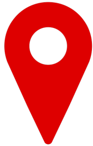
Virtual Site Visits

JIRN Offers Several Services tailored to the unique needs of SACs