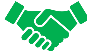
Mutual Assistance Program